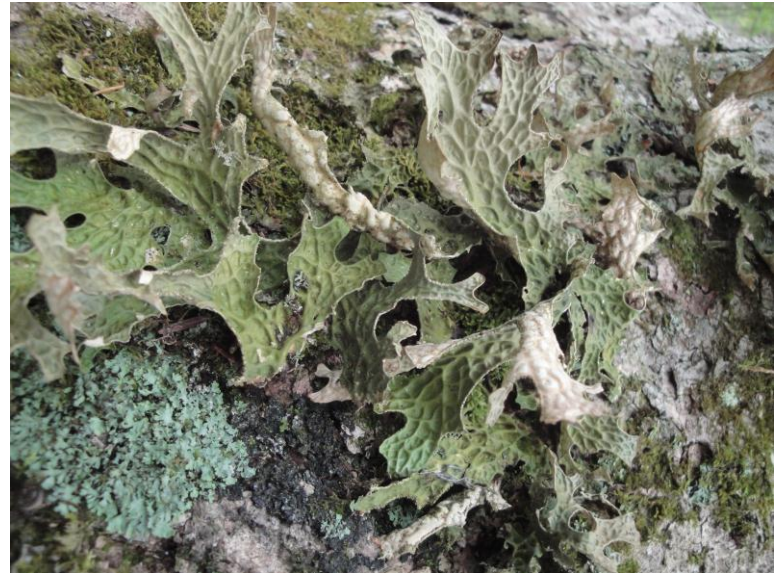
Lobaria pulmonaria (a.k.a the Lung Lichen) shown here growing on a large boulder in a late successional forest stand in Loyalsock State Forest. This species is indicative of habitats with very low disturbances.