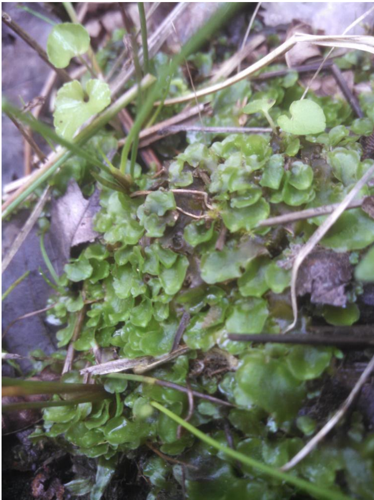
Pellia epiphylla (a simple thalloid liverwort) growing on wet soil along a stream in Buchanan State Forest in Bedford County. This species prefers acidic moist to wet substrates and is relatively common throughout Pennsylvania

During the analysis for state ranking we were able to identify those counties that need more survey and inventory work. We found that the least species rich county is Montour with 15 documented species and the most species rich county is Monroe with 381 species. An updated checklist for Montour County has been prepared is expected to be published late 2015 or early 2016. Other under-collected counties (Northumberland and Jefferson) with low species numbers have been surveyed and checklists are prepared for publication in late 2015 or early 2016. In addition, work is underway on checklists for Erie, Lehigh, Northampton, and Lycoming counties