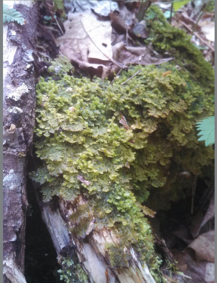
Trichocolea tomentella (a leafy liverwort) growing on wet decaying logs along Solomon's Run in Tiadaghton State Forest in Lycoming County. This species prefers circumneutral to calcareous moist substrates and is relatively common in Pennsylvania