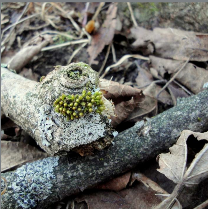
Ulota crispera (right) growing on a red maple branch in a floodplain forest.