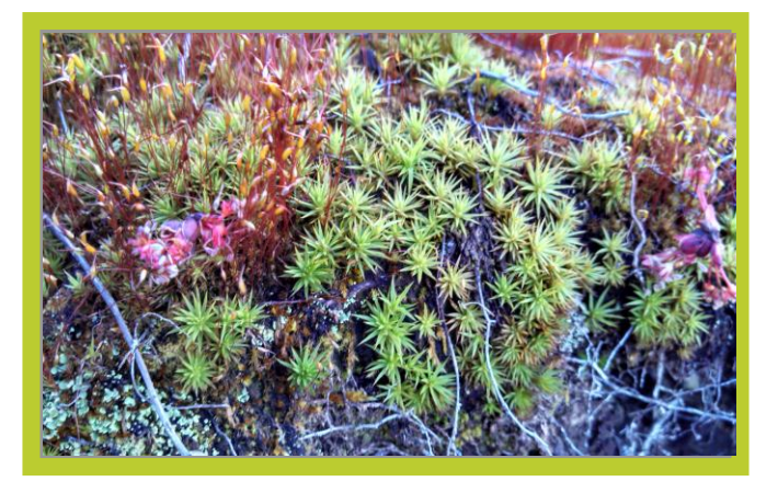
Polytrichum commune growing in disturbed soil mounds along the forest edge in Tiadaghton State Forest looks like young pine tree seedlings.